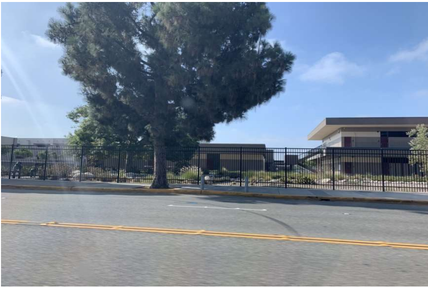
View across street