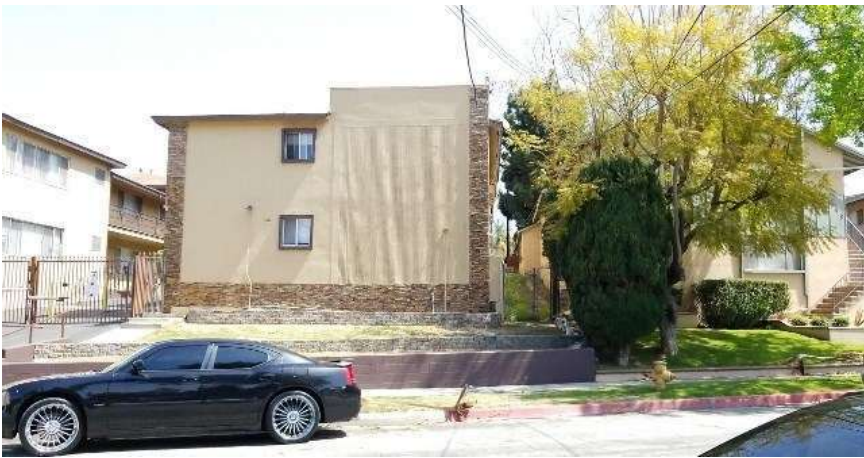
View across street