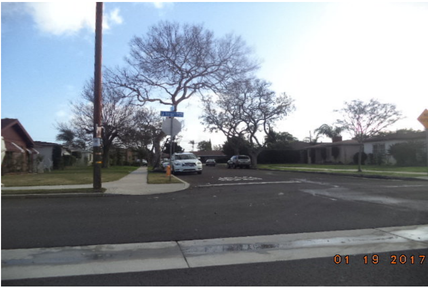
View across street