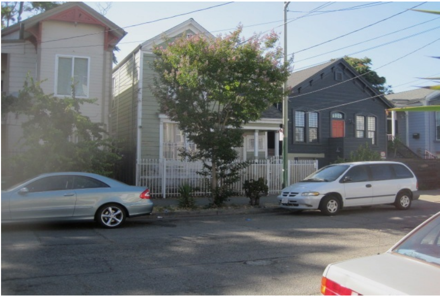
View across street