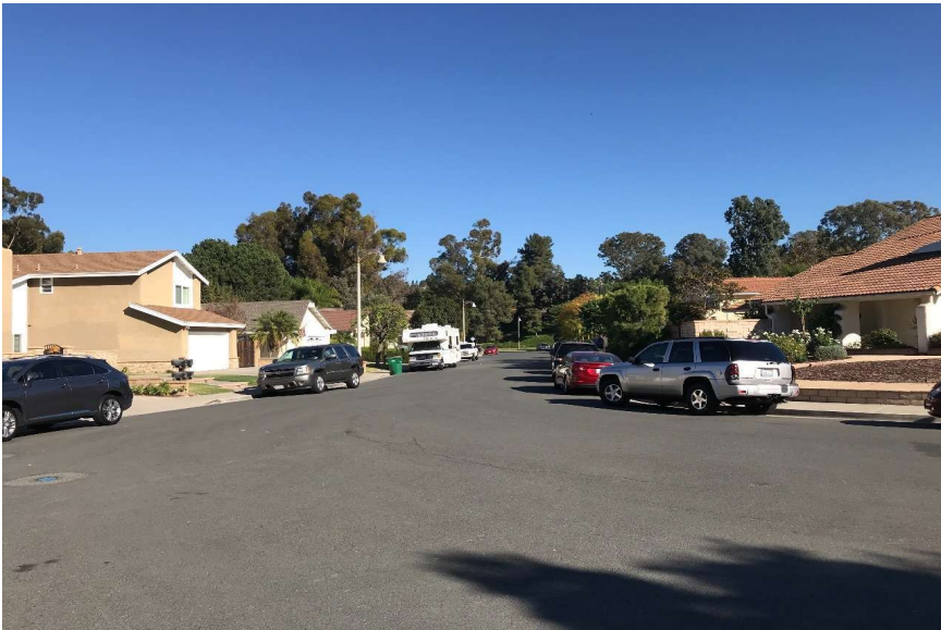
View across street