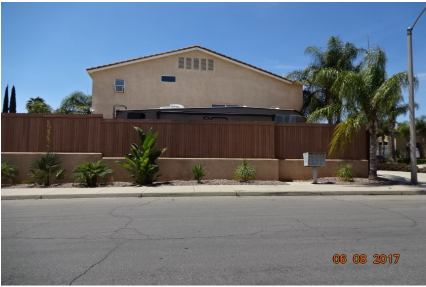
View across street