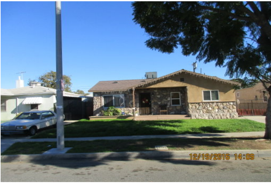
View across street