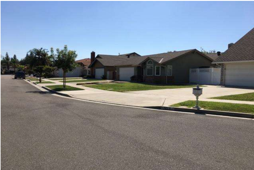
View across street