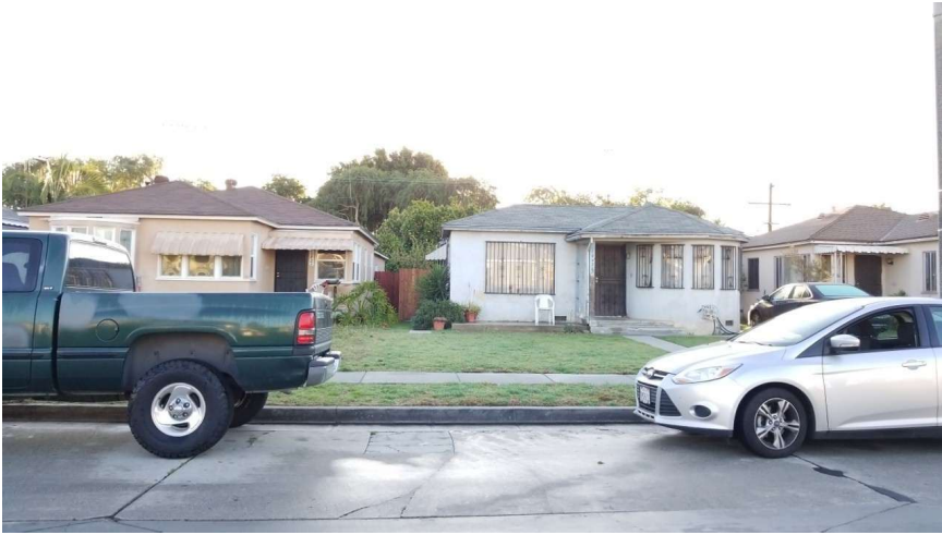
View across street