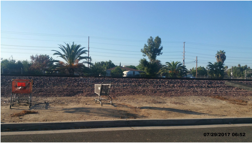
View across street