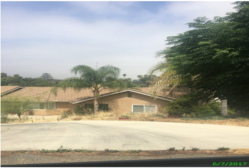
View across street