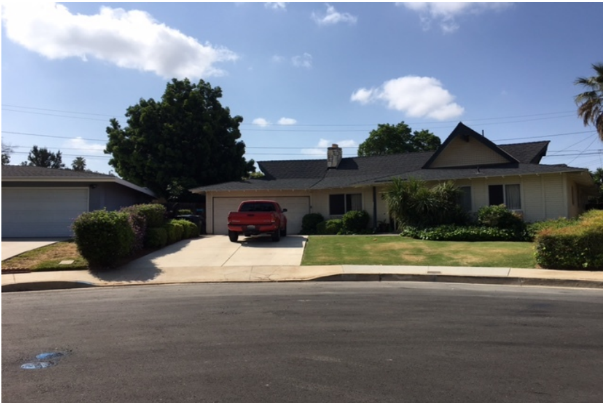
View across street