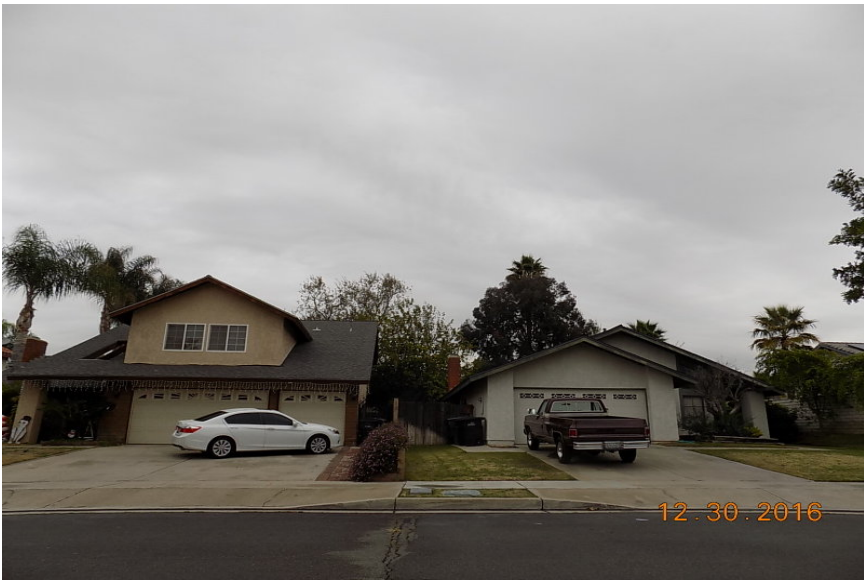
View across street